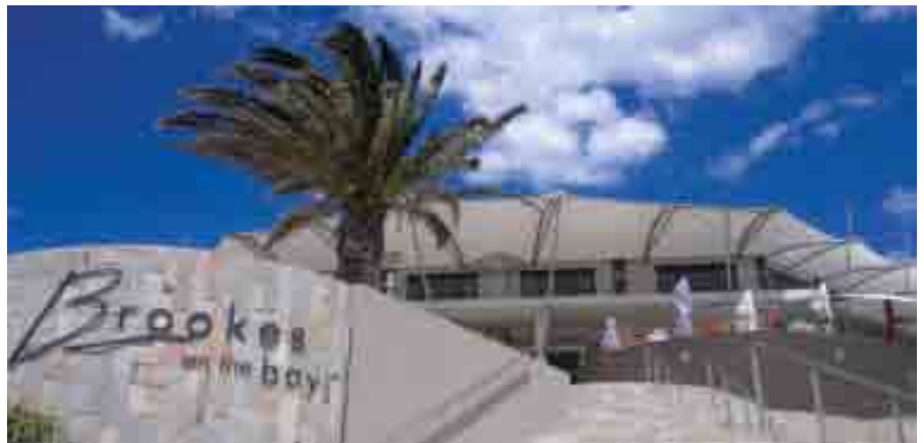
Brookes on the Bay has been revamped, improving the area and facilities available to members

As a result of our ongoing commitment to constantly improve the Brookes Hill facilities for our visitors and or guests, we are to undergo a major facelift of all 18 bathrooms in 2012. The renovations will include a top to bottom facelift of all apartments, which will aim to not only delight visitors with a fresh look and appeal, but also aims to significantly increase the overall value of the Brookes Hill apartments while adding to the experience of our visiting patrons.